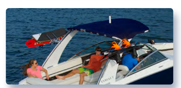
R Models Surf and WSS Arch Bimini Top