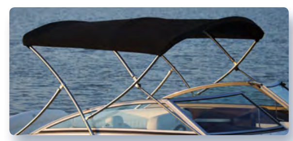
Premium Bimini Top