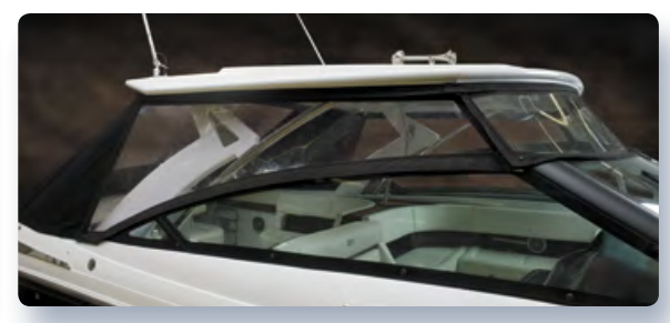
Full Canvas Enclosure (shown on A40)