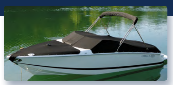
Bow & Cockpit Tonneau Covers