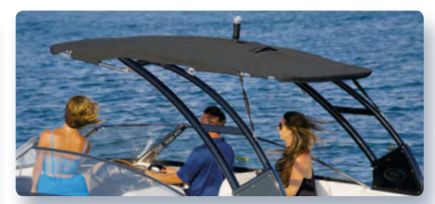
Surf & WSS Folding Arch Bimini Top