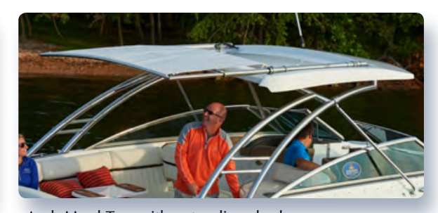
Arch Hard Top with extending shade