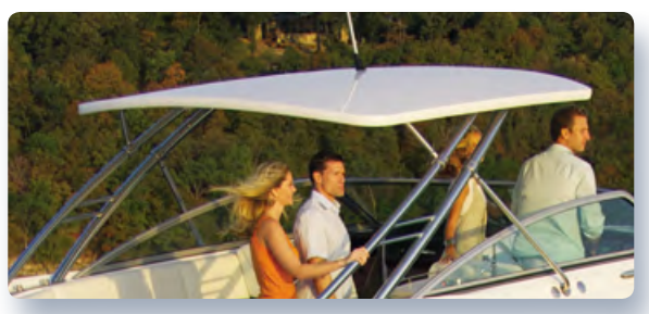
Arch Hard Top