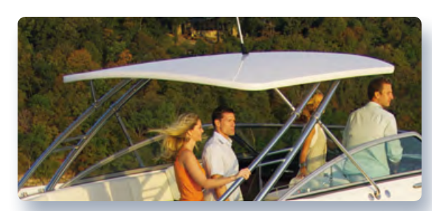
Arch Hard Top