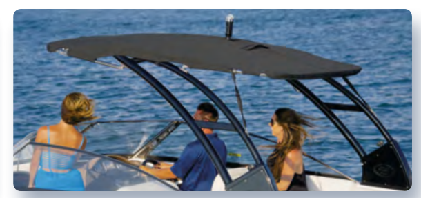
Surf & WSS Folding Arch Bimini Top