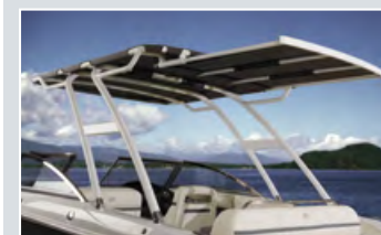
A permanent rigid structure with a stretched canvas top covering, and the extendable sunshade aft. Available for models 23SC and 25SC.