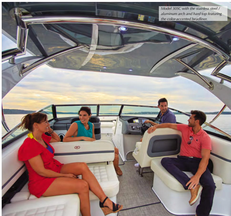
Model 30SC with the stainless steel / aluminum arch and hard top featuring the color-accented headliner.

Cobalt's selection of premium arches, tops and covers not only protect from the elements, they offer next level styling and great looks to your new boat. Arches range from aluminum tube construction with canvas biminis that easily fold down for trailering and storage, to solid structures featuring stainless steel accents and canvas sunshades or elegant hardtops.