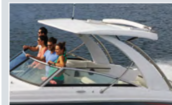
Available in black or white on models R30 and 30SC. SureShade is available in a manual pull-out or electrically deployable version.