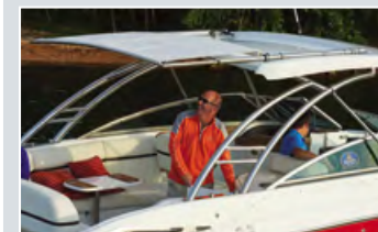
This top with an electrically deployable SureShade is standard equipment on model R35. A color-accented headliner is optional.