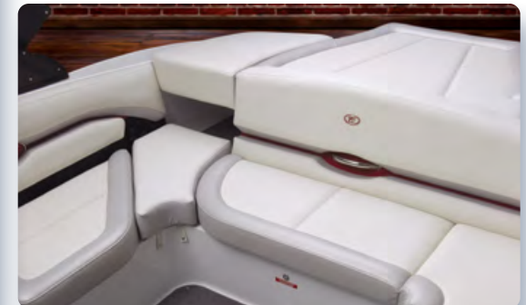
L-Lounge with Aft Filler Cushions