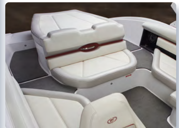
Dual Aft Walk-Thru Interior