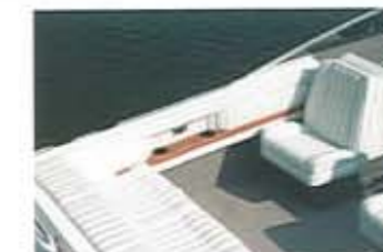
Side panels incorporate drink holders and indirect lighting