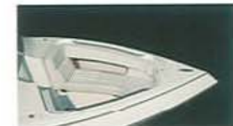
Bow seating area