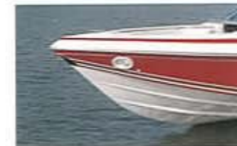
Docking lights available for most models