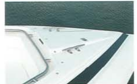
Self draining anchor storage