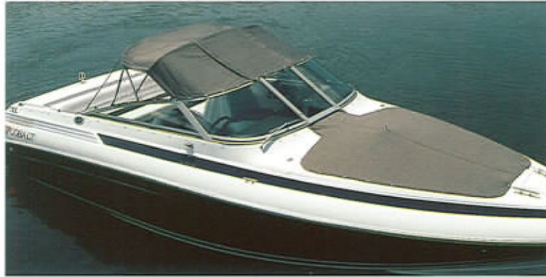
Bow tonneau/standard top

Cobalt tops, camper tops, etc., are manufactured using Sunbrella™, a 100% acrylic woven marine fabric.