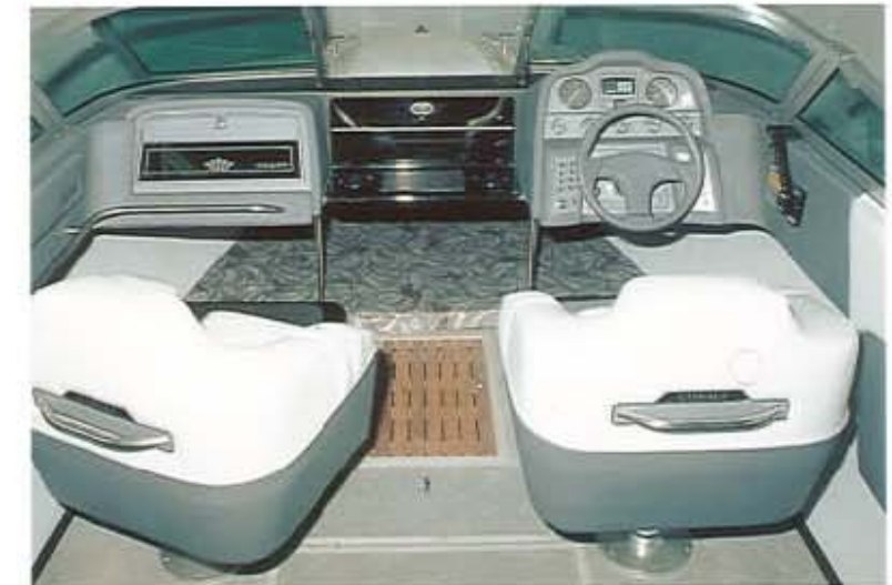
Spacious under deck accommodations