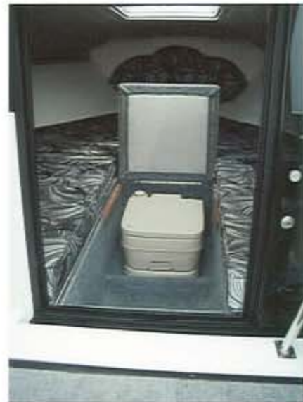
Porti-potti (223 shown)