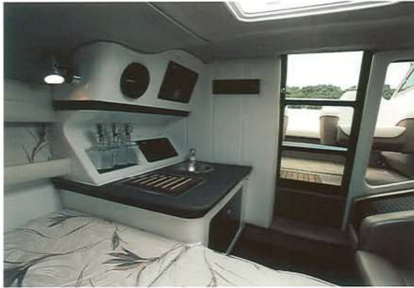
243 full galley