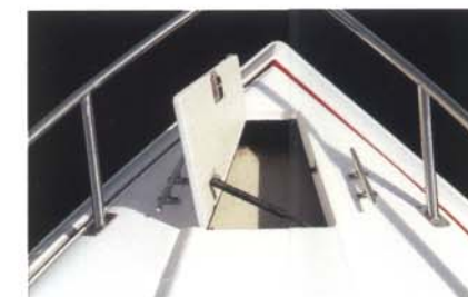
Self draining anchor storage