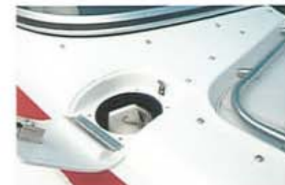
Internal fender storage