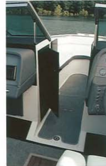
Large bow entry with doors