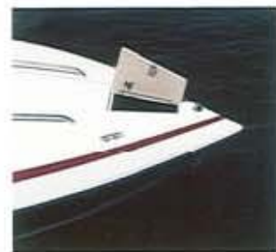
Self draining anchor locker