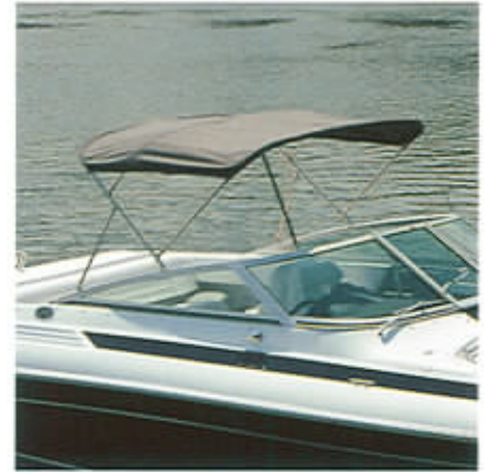
Bimini top (Avail. some models)