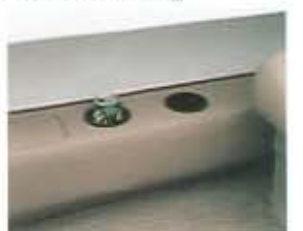
Drink holders are oversized to accommodate insulated coasters.

A Cobalt boat seat is, to an impressive degree, designed for comfort. The base is a heavy, multi-density foam for support and shape-retention. A softer, more pliable foam offers maximum comfort. A thick, rich 39-ounce vinyl with the feel of leather — made especially for Cobalt — covers the most durable seating you can buy. Three clear layers provide protection against abrasion, scuffing, and ultra-violet fading. And the vinyls are Prefix™ coated for maximum stain resistance. Rugged yet beautiful, they're Cobalt quality all the way.