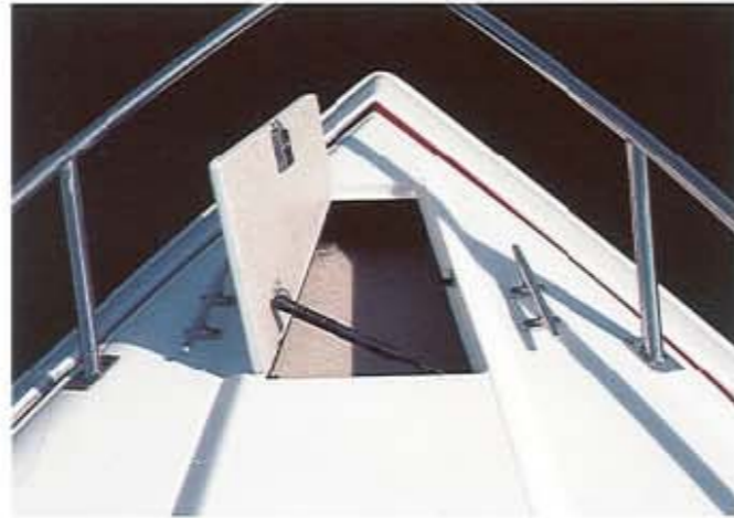
Self draining anchor locker