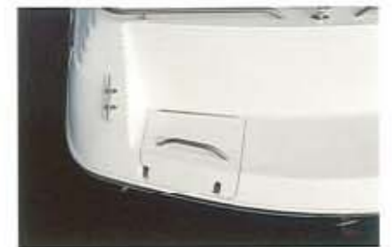
Hide away flip down boarding steps