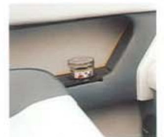
Drink holder boarding step