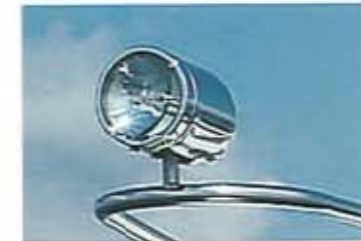
Spotlight — also available with deck mount