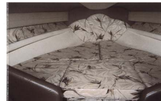
Berth incorporates storage area

The 243 is unique, sleek and truly sets the pace for performance. Its sporty cockpit belies its outstanding overnight capabilities. A versatile, generous, sophisticated boat, it is unquestionably Cobalt.