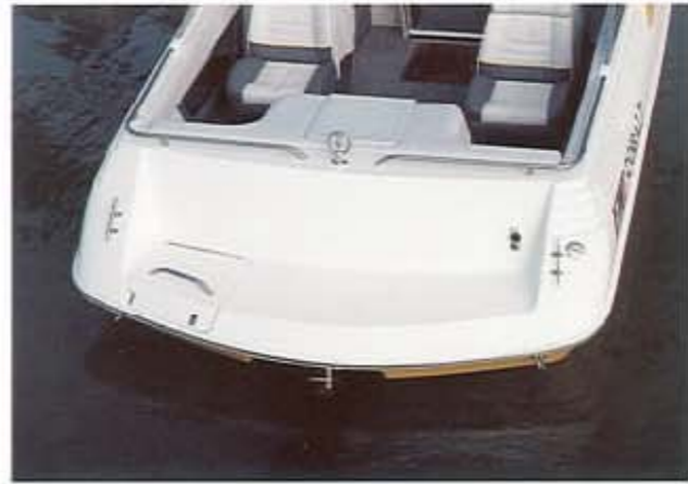
Integral swim deck (206 shown)