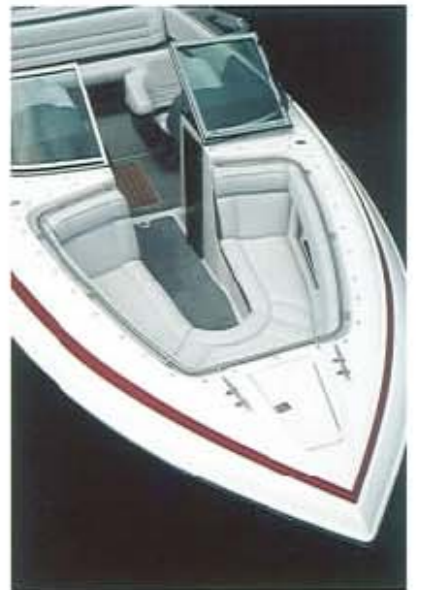
Spacious bow area