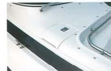
Integral fender storage

Centerline 25' 2" 7.67M Beam 8' 6" 2.59M Weight 4300 lbs. 1950K Fuel Capacity 88 gal 333L