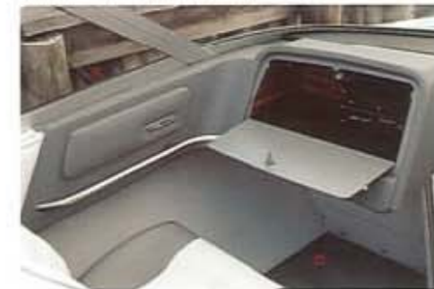
Lockable glove box