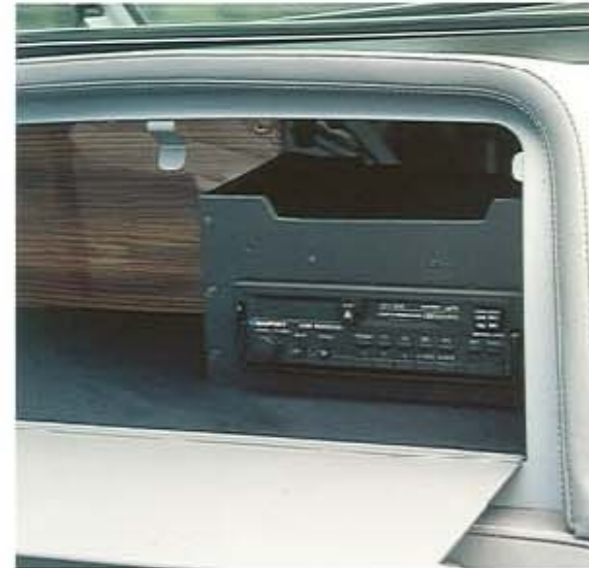
Pull out security stereo system