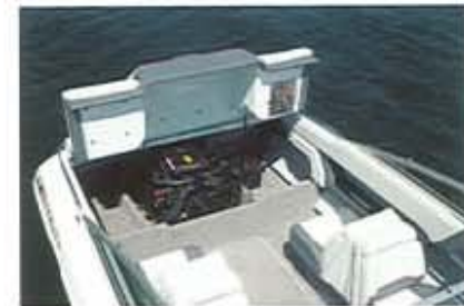
One piece motor box assembly