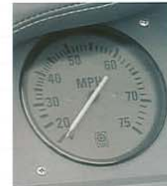
Color matched VDO instruments.