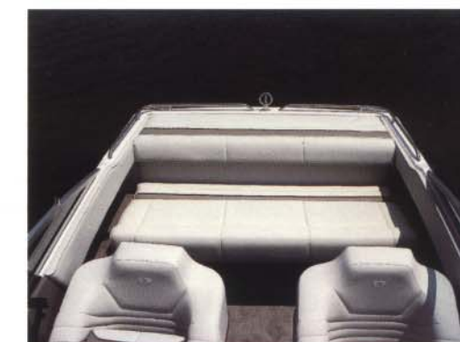
Back seat converts to extra berth