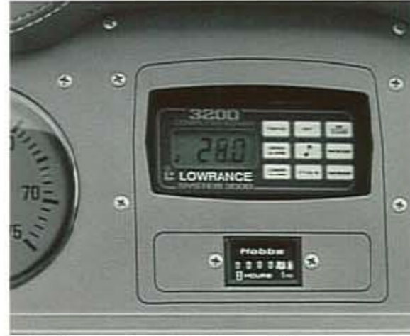
In-dash depth sounder (standard some models)