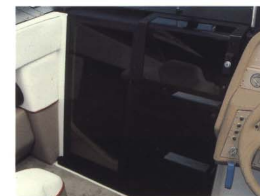
Lockable cabin door w/access to fore deck