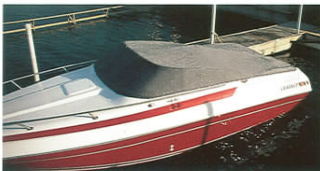
Cockpit tonneau cover