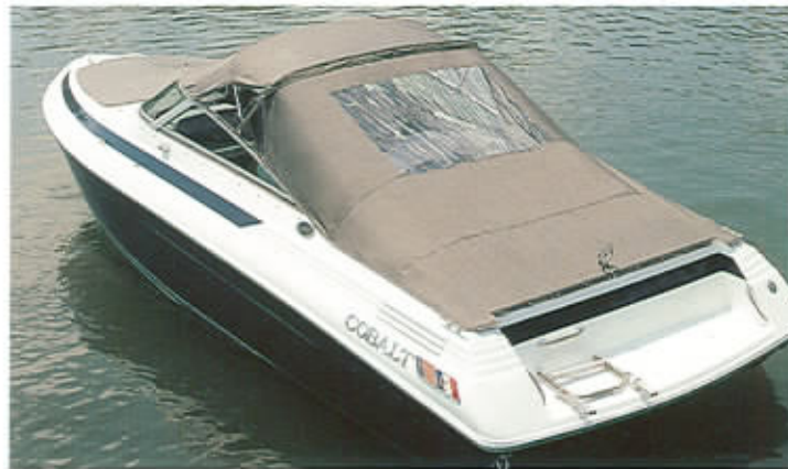
Stern curtain/std. top/bow tonneau