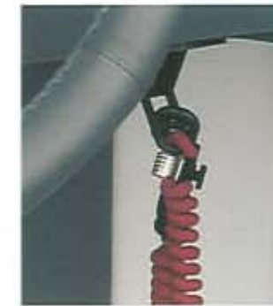
Ignition safety switch (all models).