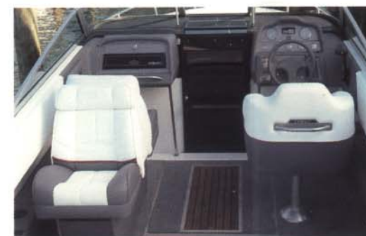
Spacious seating arrangements

With foresight and canny engineering, Cobalt has created a boat with the luxury and features boaters expect in the best. The Cobalt 255.