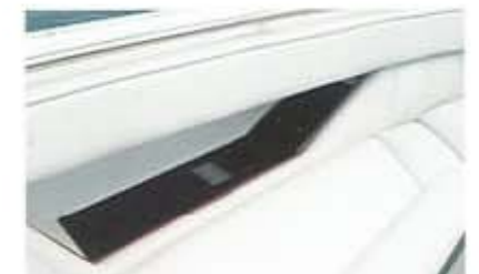
Drink holder modules include stereo headset jacks

Centerline 22' 3" 6.78M Beam 8' 5" 2.57M Weight 3400 lbs. 1542K Fuel Capacity 55 gal. 208L