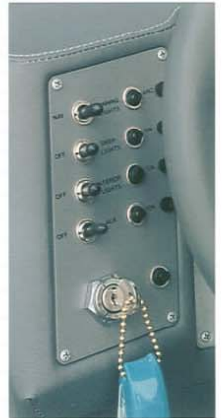
Coated aluminum panels, aircraft circuit breakers, stainless switches, all to insure reliability.