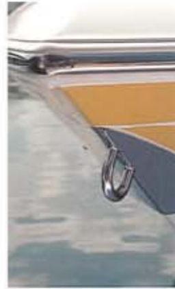
Row scuff plate