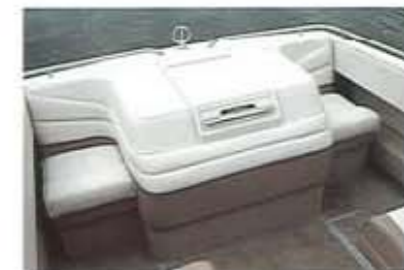
Motor box table top