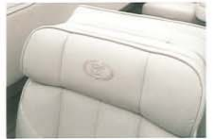
Custom tailored vinyls

Comfort and convenience are not simply catch phrases, they become fact in Cobalt boats.