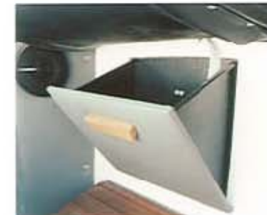
Convenient trash receptacles.

Granata Design interiors, as shown on this Conduire 206, typify Cobalt's concern for the humans who use them.