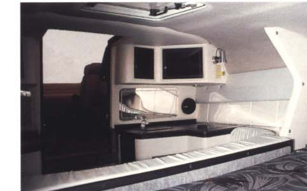
Full galley (standard cabin)