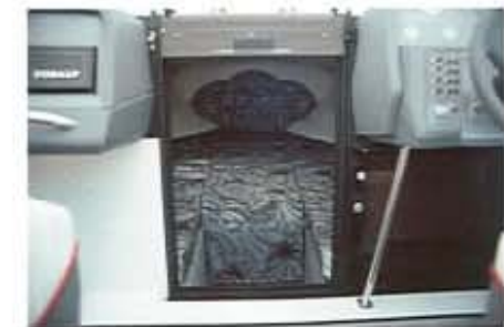
Lockable cabin entry