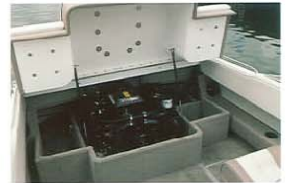
One piece fiberglass motor box adds to longevity and serviceability.

Granata Design interiors, as shown on this Conduire 206, typify Cobalt's concern for the humans who use them.