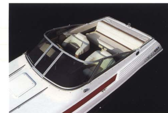
Sundeck area includes ski tow eye