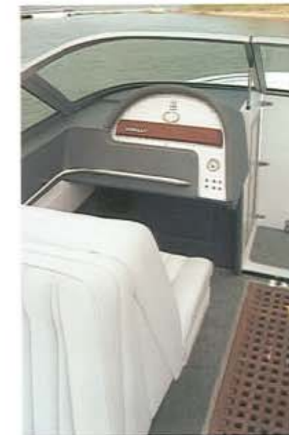
Port dash (includes glove box and clock)