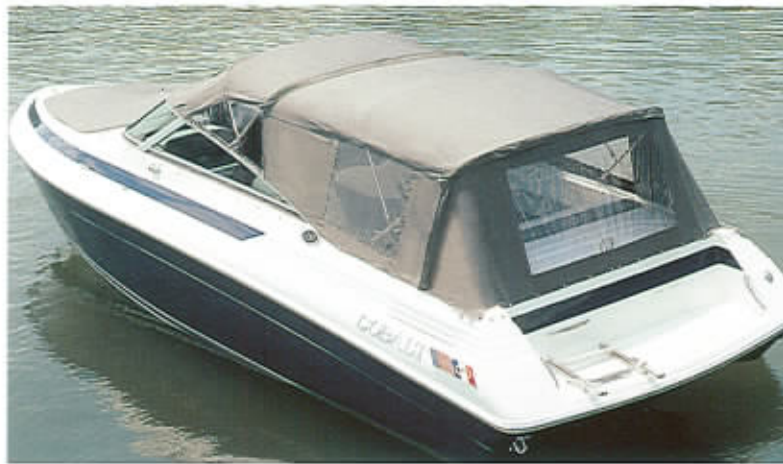
Camper top (available most models)