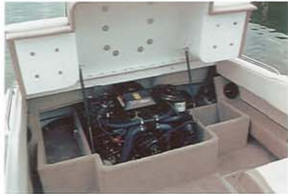
One piece motor box