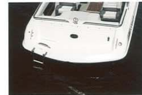
Swim platform with hideaway ladder