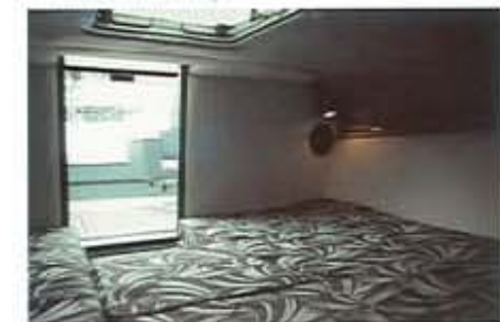
Spacious cabin interior