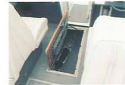
Lockable ski storage