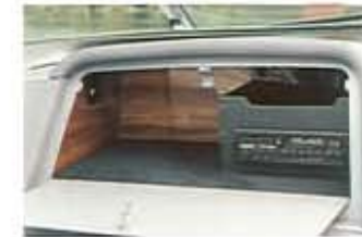
Spacious glove box incorporates optional stereo system.