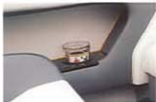
Built in drink holder