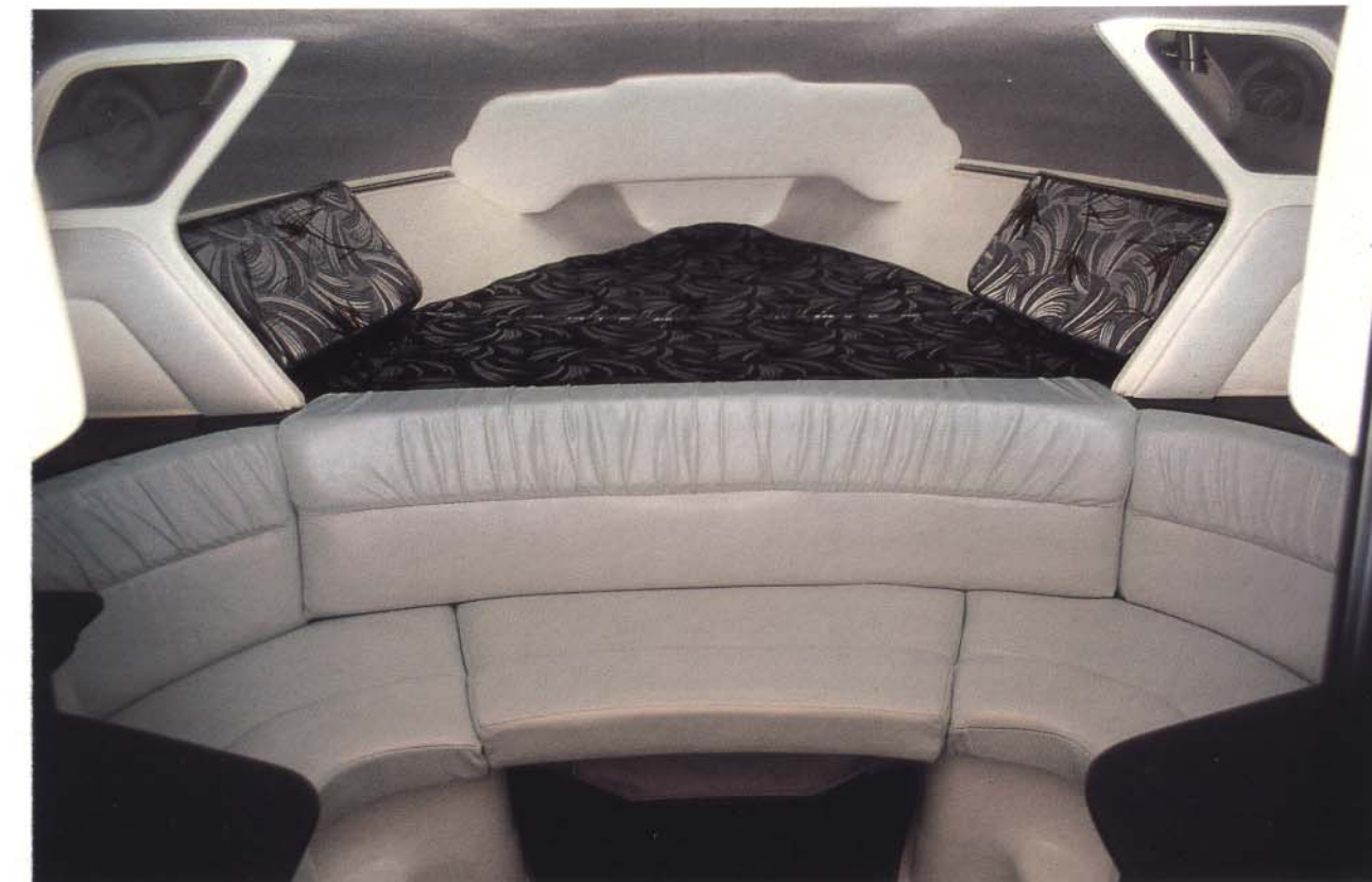
Spacious forward cabin (pulls out for sleeping) (standard cabin)