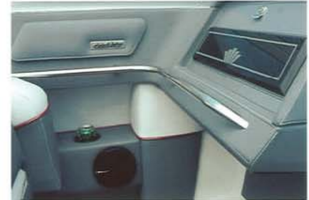
Convenient hand holds