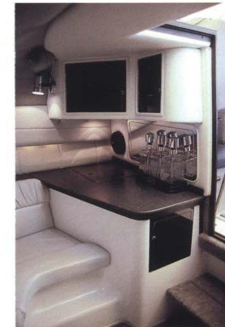
Galley includes refreshment center (standard cabin)