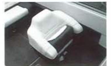
Convertible bolster bucket seats