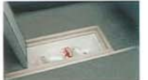
Floor mounted insulated ice chest is self draining.