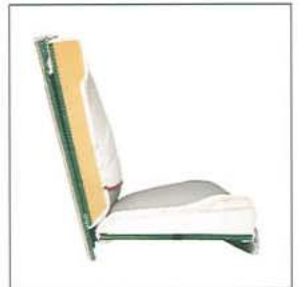
Multi-density foams, treated woods, Aluminum framing — just part of the VaraDense™ construction process.