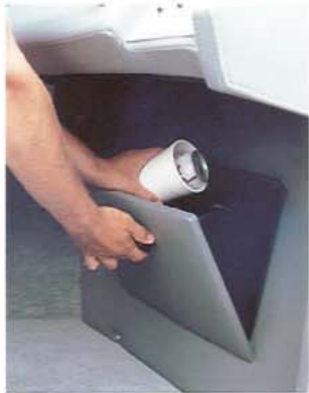
Trash receptacle most models (22T shown)