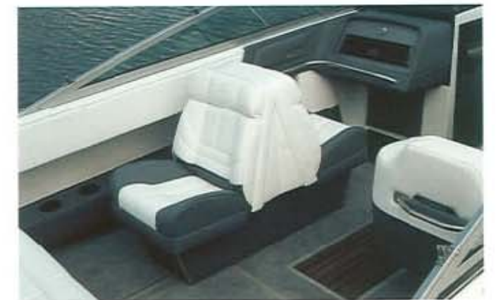
Sleeper seats convert to lounges