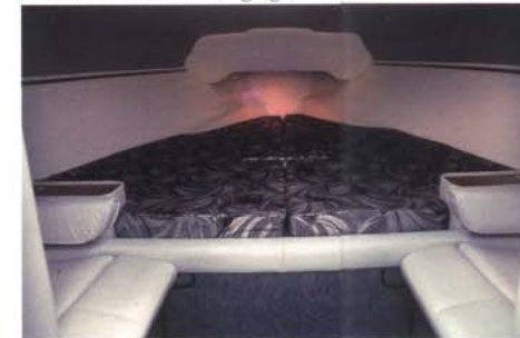
Club cabin berth area