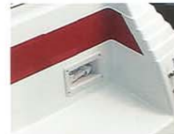
Aft shower (255 shown)