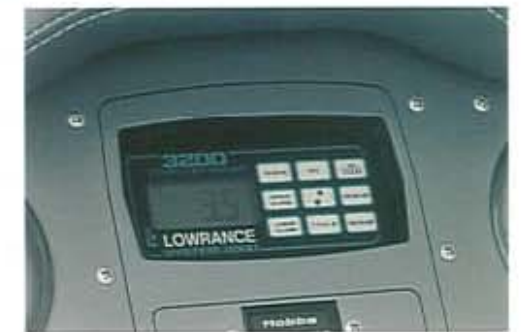
Built-in Lowrance 3200 Depth Finder (standard in some models).