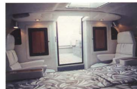
Club cabin includes hanging lockers