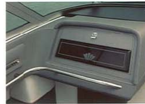
Convertible hand holds