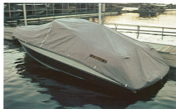
Mooring cover (243 shown) made of 100% cotton marine canvas