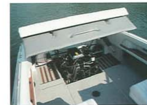
Electric/manual motor box