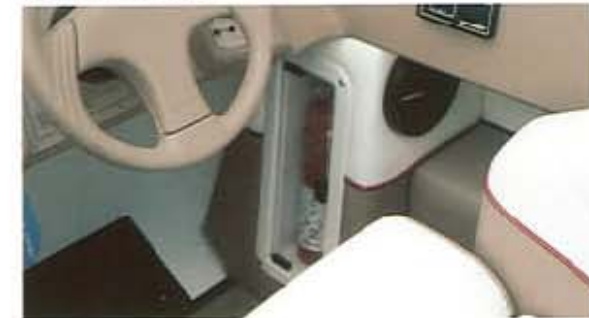
Fire extinguisher is thoughtfully out of the way.