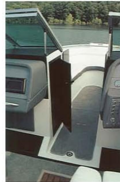
Hanging lockers (252 shown)