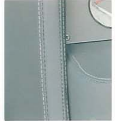
Custom fitted, matte finish vinyls for maximum glare resistance.

Granata Design has transformed this basic functional component into an integral part of the overall interior design. It becomes a one-piece fiberglass component sweeping into the side panel and throttle control in an unbroken amalgam of elegance and practicality. The colors are classic, materials exceptional. Instruments and gauges are perfectly placed for optimum visibility. The driver maintains complete control while savoring the quiet refinement of good design.