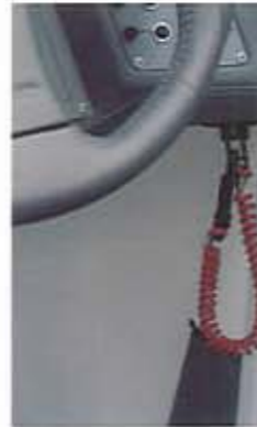
Ignition safety switch