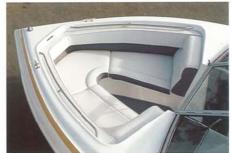
Spacious bow area with removable carpet