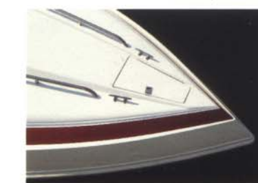
Self draining anchor locker

Conversation and companionship are easy in the thoughtfully-designed 243 Condurre cabin with its plush fabrics and genuine leather, center-facing captain's chairs.